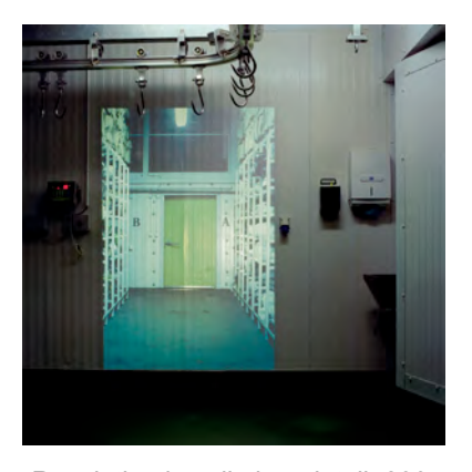
Resolution installation, detail, 2004