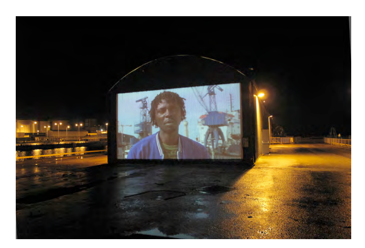
Prospect, video projection, TULCA 2010 Festival of Contemporary Art, Galway, Ireland

Wolverhampton Art Gallery Museum of Contemporary Photography, Chicago British Council Crawford Municipal Art Gallery, Cork National Museum of Media, Bradford, UK Royal Armouries Museum, Leeds, UK University of Salamanca, Spain Victoria & Albert Museum, London, UK Private collections worldwide