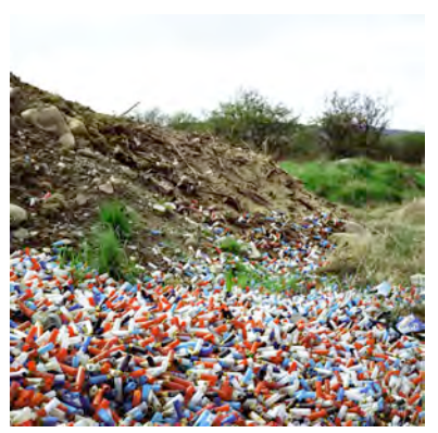
Shotgun Cartridges N. Ireland border