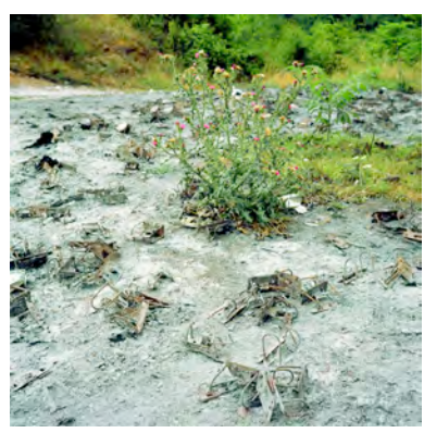
Destroyed Files, Bosnia