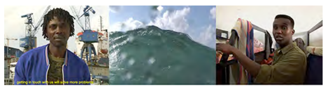
Video stills from the video installation, Prospect, 2008