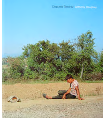
Disputed Territory catalogue, 2006

His work has been exhibited and collected internationally and is represented in public and private collections. Disputed Territory (2006) is a long-term project that examines conflicts over territory and identity in contemporary Europe. It is a quiet investigation into the slowly unfolding aftermath of conflict in Ireland, Bosnia and Kosovo.