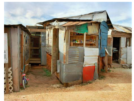
Andrea Robbins and Max Becher, Global Village: Shanty Store , 2003, 1/5, archival ink jet print, 18 1/16 x 22 7/8 inches, Courtesy of Sonnabend Gallery, NY and the artists

Robbins/ Becher photographed their new series “ Global Village ” at a discovery center and park recently opened by Habitat for Humanity at their international headquarters in Americus, Georgia. The “attractions,” meant to promote awareness and inspire donations, consist of slum reconstructions, derived from photographs and film footage of actual sites. (Sadly, hardship is actually found right outside Global Village's front door: 28% of the population of Americus is living at poverty level.) For nearly twenty years, Robbins and Becher have investigated places that resemble other places as a result of colonialism, immigration, diaspora, and tourism—an effect they term “The Transportation of Place.” With each series they employ a different photographic style fitting the subject; in “ Global Village ,” they reference FSA photography of 1930s America. Robbins was born in 1963 in Boston, MA, and Becher was born in 1964 in Düsseldorf, Germany. Both hold BFA degrees from the Cooper Union School of Art (NY). Robbins studied at Hunter College (NY) and Becher holds an MFA from the Mason Gross School of the Arts at Rutgers University (NJ). Both are Assistant Professors at the University of Florida at Gainesville. A monograph of recent work, The Transportation of Place , will be published by Aperture in 2006. This is the first time work from this series will be shown. They are represented by Sonnabend Gallery (NY). Their website is robbinsbecher.com .